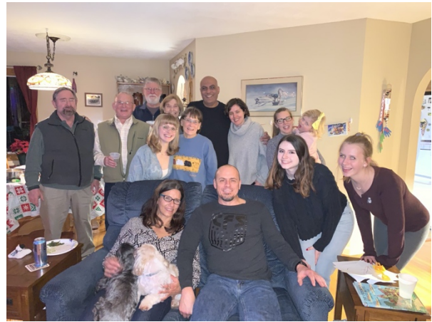
Cornell Ophthalmology team and family

join our team. He hit the ground running and shortly after his arrival had his lab fully functional. He had several projects ongoing, many involving students and residents. During his short time with us, he built a reputation of being a team builder, dependable collaborator and was well loved and respected by students and his colleagues. I will always admire how much he accomplished during his time with us.