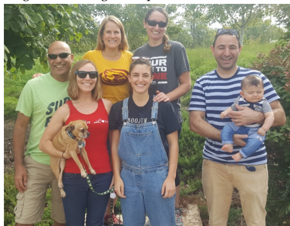
Iowa State University Ophthalmology team

exam, an afternoon wet lab on ‘common ocular surgeries for the general practitioner’, and so on.